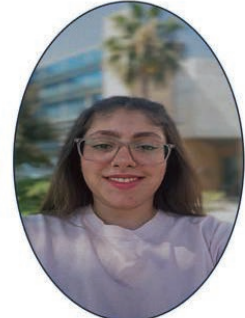
Talar Qsous UI/UX